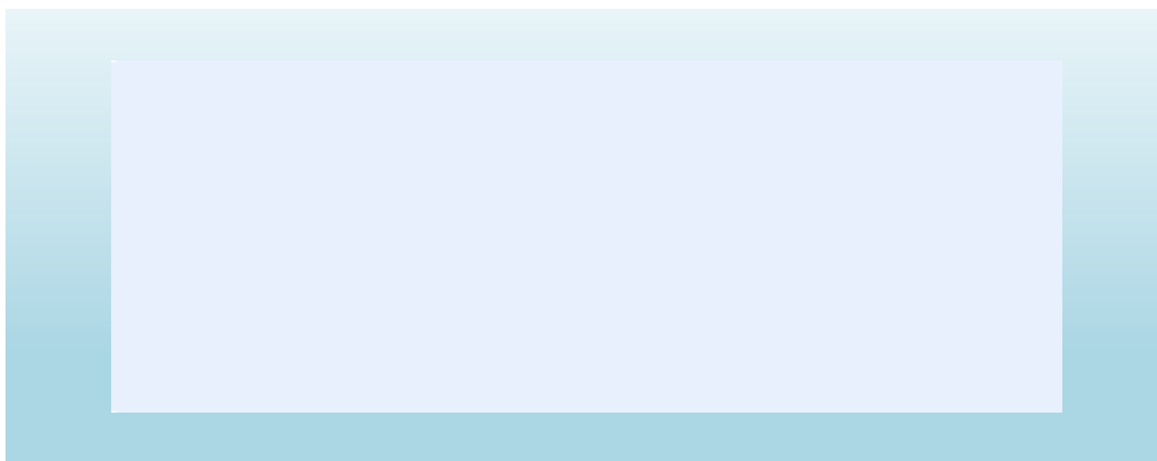
Figure caption if needed. (style: Caption)

Figure #. Description of Figure (style: Heading 3)